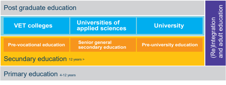
System of education and training